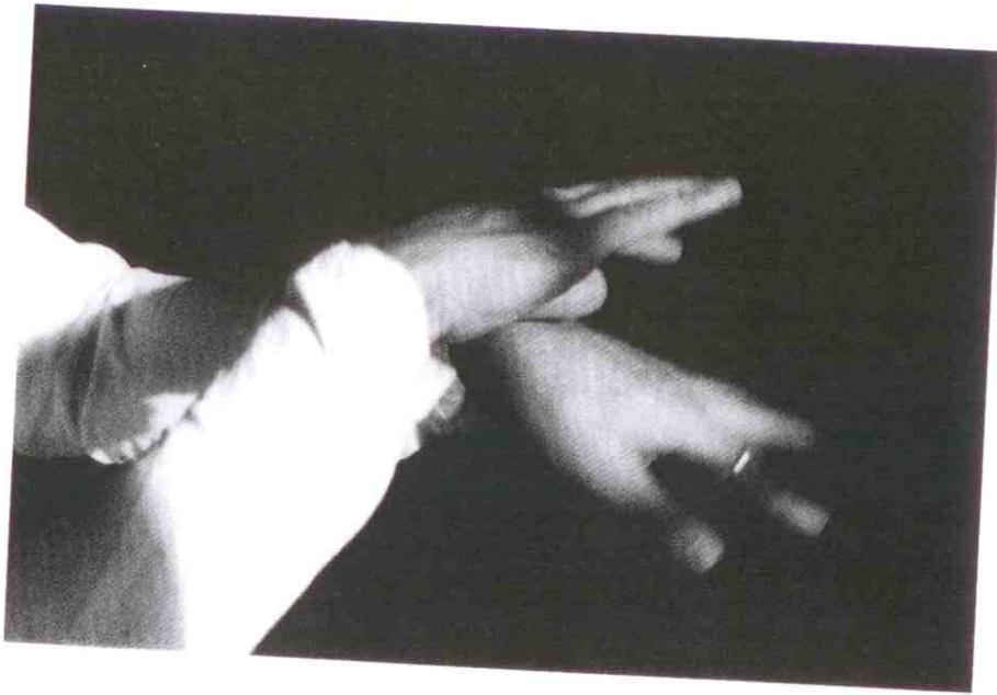
FIGURE 9 On my return to London, I learnt Kathak dance, at the Academy of Indian Dance, as this is the classical dance style of Northern India and one that the Muslim moghul rulers of India adopted into their courts. I wanted to fill the room with the janak janak of a Kathak dancer.