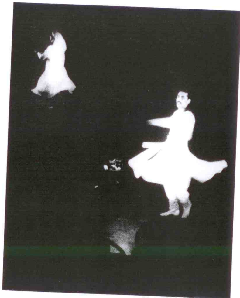
FIGURE 11 There is always the hope that in the future differences will be accepted and not used to instigate struggles of power. Like subjectivity the future is constructed and must involve us all from different backgrounds and locations.