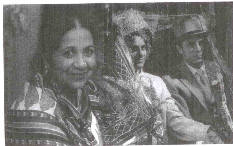
FIGURE 5 Photomontage of press stills from Destiny Desire Devotion .

It is not enough to try to get back to the people in that past out of which they have already emerged, rather we must join them in fluctuating movement which they are just giving shape to, and which, as soon as it has started will be the signal for