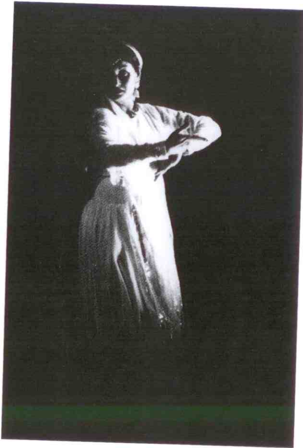
FIGURE 7 Gunghroo Jameela. Opening dance sequence includes thât, amad and salami (technical Kathak dance terms for standing posture, introduction and salutation respectively)