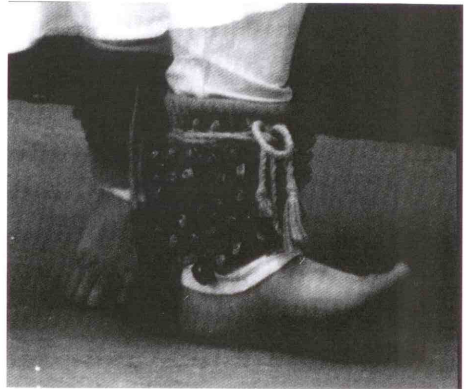
FIGURE 10 Tha thei thei tat / aa thei thei tat / tat tat ta / dig tha dig dig thei / tat tat ta / dig tha dig dig thei / tat tat dig tha that dig tha dig dig thei / dig tha dig dig thei / dig tha dig dig thei dig tha dig dig thei / dig tha dig dig thei / dig tha dig dig thei dig tha dig dig thei / dig tha dig dig thei / dig tha dig dig thei